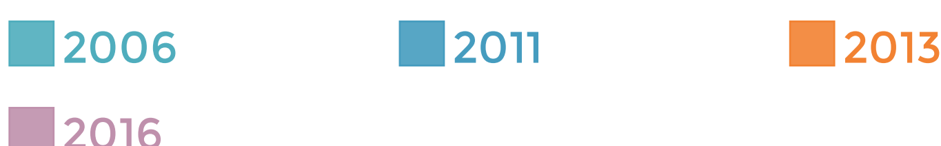
Arab Youth (18-34 years) % Political Participation In Decline

Arab Youth are disengaged from formal & informal politics